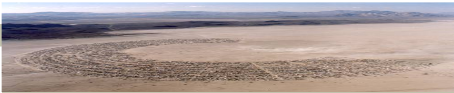
The Village of PolyParadise location TBD