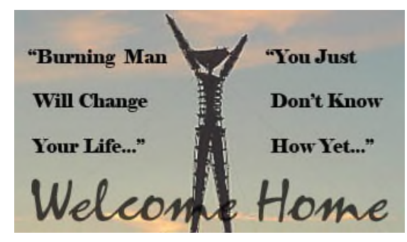
Please See Things to think about - page 5

All food and colored liquids must be properly labeled and somewhat recognizable.